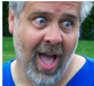
"Me Likey the Booty!"