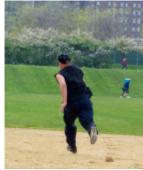
“My biscuits are burning!”